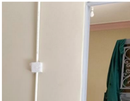
Switch for the interior bulbs