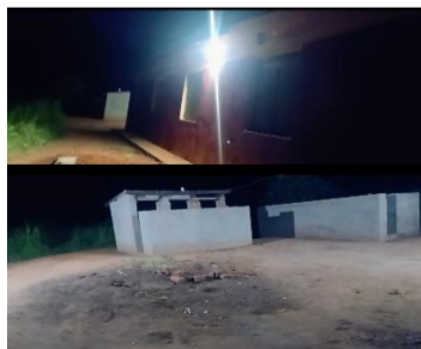
Light behind a block & at Toilet SHu