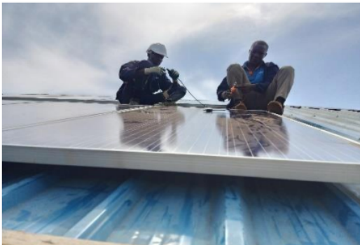
Installation of the 8pcs 320w panels at SHu