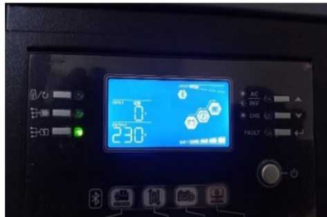
Inverter reading showing loads, battery charge level and output of 230v with AC