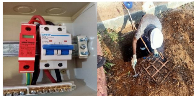
Surge Arrester (red) & DC breaker and lightning protection system installation at the Clinic/office block