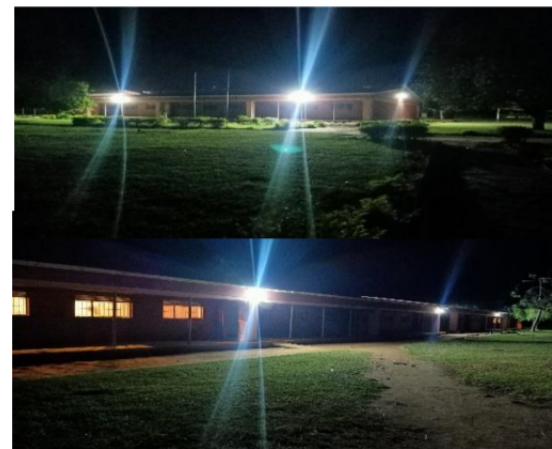
Lights in a classroom and the front & behind views of classrooms at CCLu