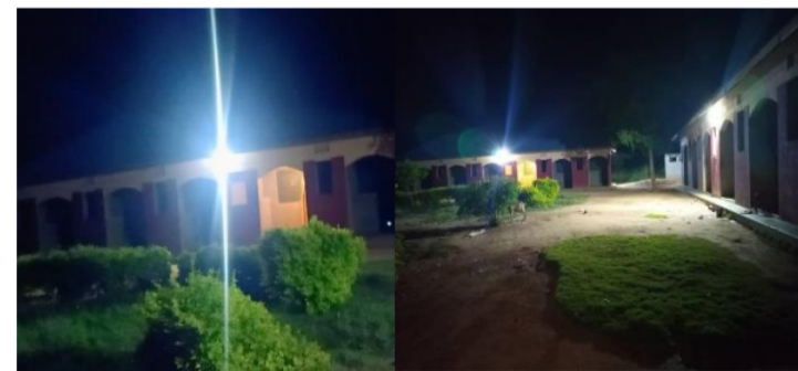
30w flood security lights facing the compound, SHu