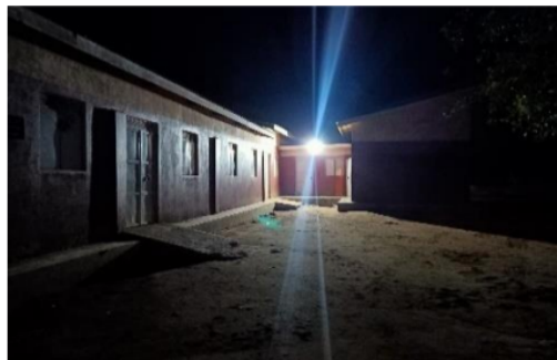
Security lights in front of Dylan Hall