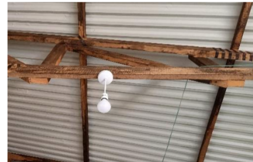
Installed bulbs inside the dormitories