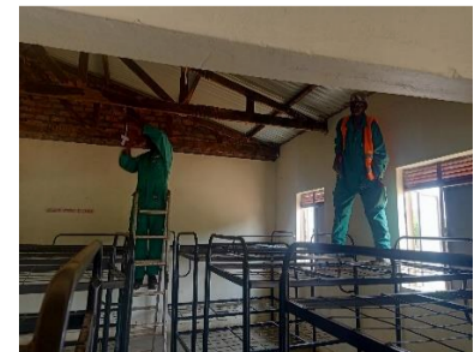
Wiring of the girls 'dormitory.