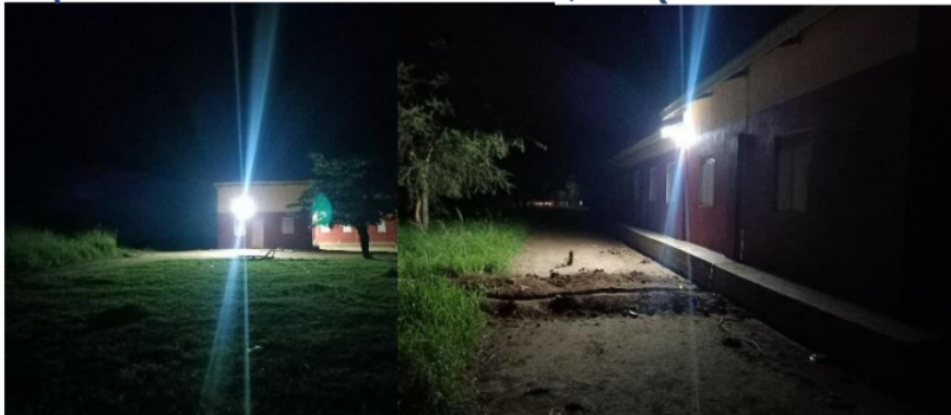
Light in front & behind the girls' dormitory