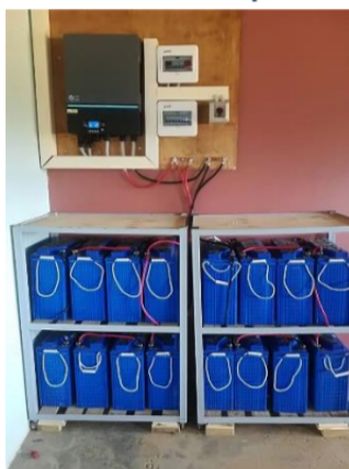
Battery & Inverter Station at classroom & Lab Unit