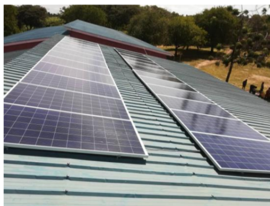
24 pcs of 320w panels mounted on classroom roof for classroom & Lab Unit.